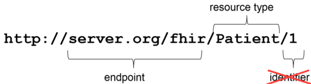
Abb.: LIES - not the identifier [1]

This wrong information finds itself in many FHIR tutorials: